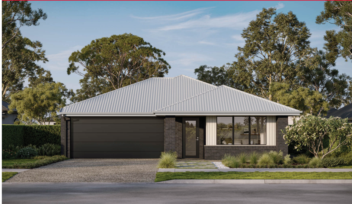
GRAMPIAN 22 | EMERGE RANGE